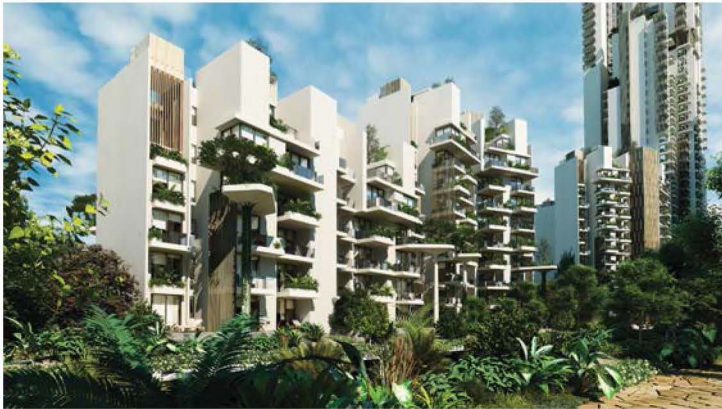
Pic. 4. A green building designed by M. Kaufmann

The practices employed in green building are constantly evolving and may differ regionally, but fundamentals are: Siting and Structure Design Efficiency, Energy Efficiency, Water Efficiency, Materials Efficiency, Indoor Environmental Quality Enhancement, Operations and Maintenance Optimization, and Waste and Toxics Reduction. The essence of green building is an optimization of one or more of these principles.