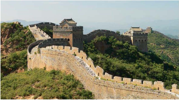
Pic. 3. The Great Wall

Troops were instructed in details to save wasteland, settle down and plant crops, and create roads, bridges, watch towers, canals, wells, and aqueducts. All these undertakings increased the trade and cultural exchange of China with remote territories.